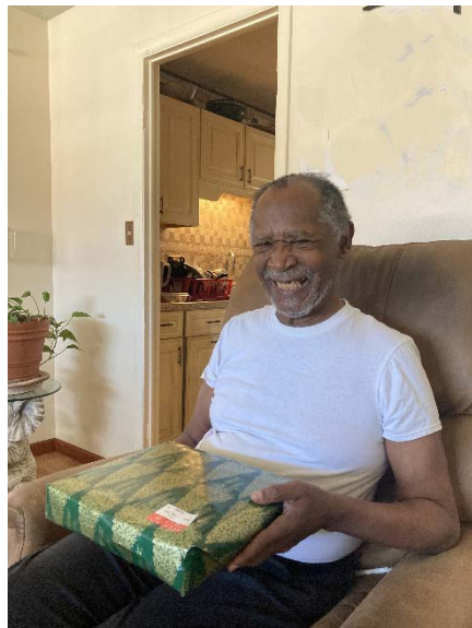
GSB Client Receiving Gift