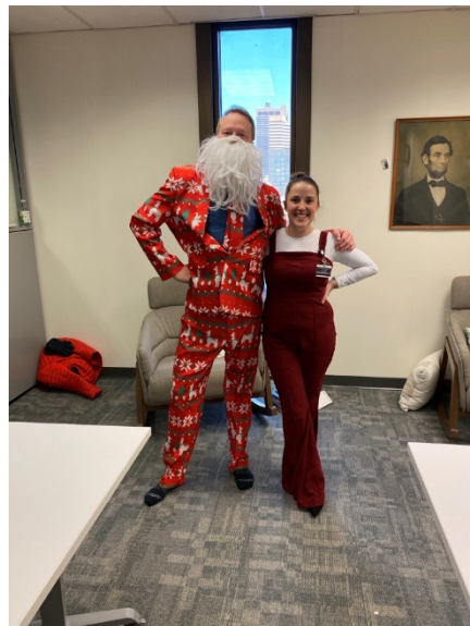
GSB Gift Wrap Event

The FCGSB works hard every year to provide our almost 500 clients with a small gift at the holidays. We seek donations through corporate sponsorship as well as our social media networks. Our clients are very excited to be remembered and are overjoyed with a gift.