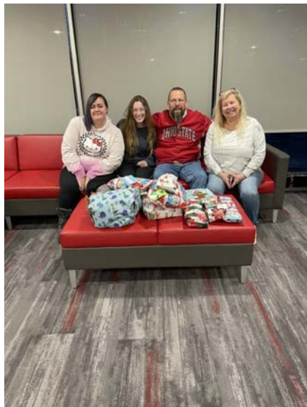
OSU Marion College of Social Work Club